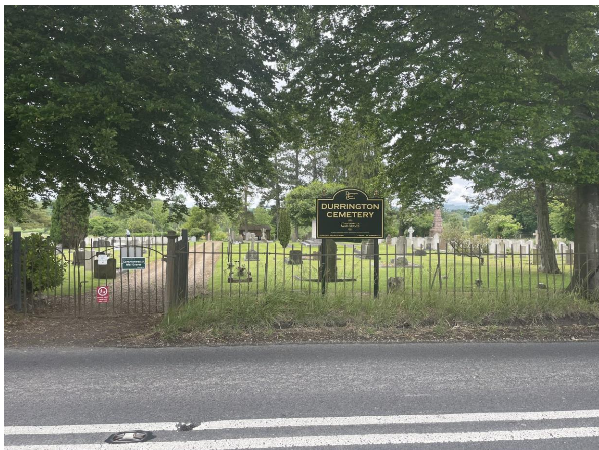
Durrington Cemetery, Wiltshire