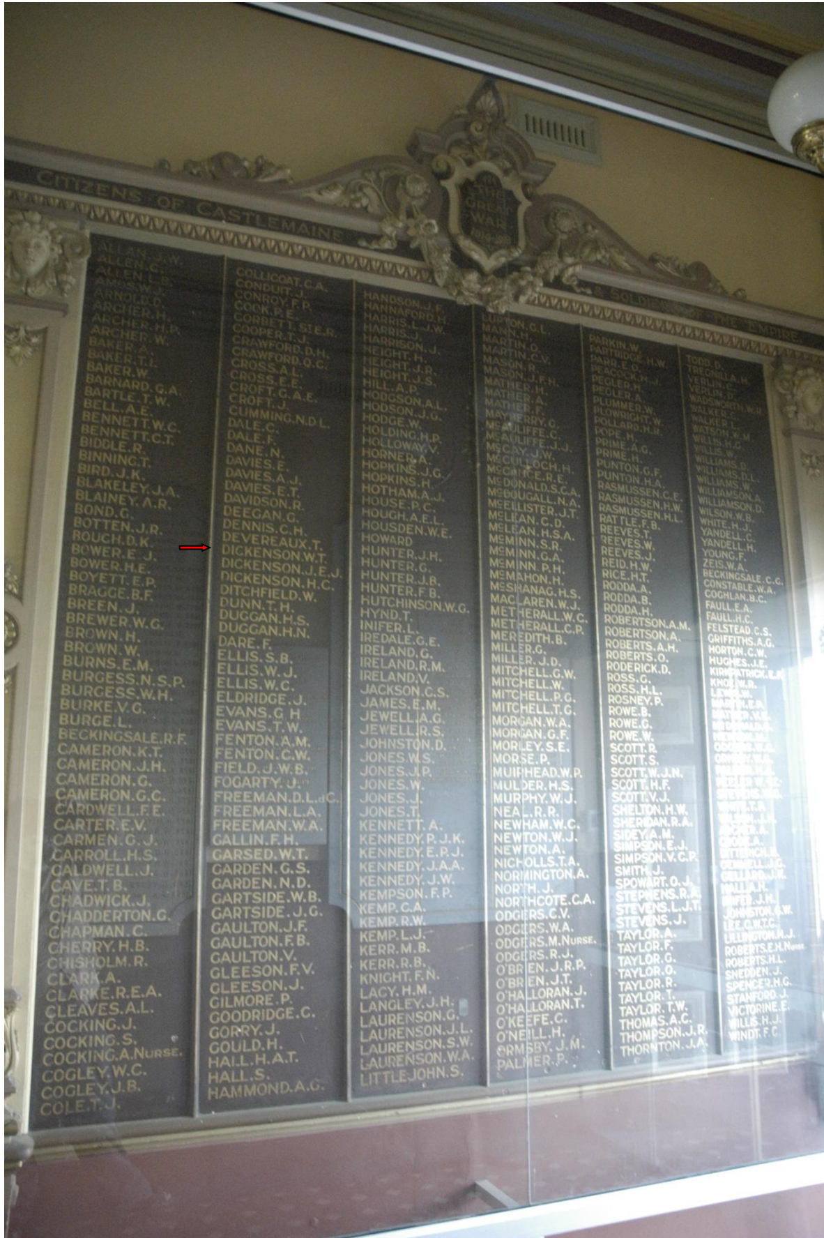
Castlemaine Town Hall Roll

W. T. Dickenson is also remembered on the Castlemaine Town Hall Roll of Honour located at 36 Mostyn Street, Castlemaine, Victoria. (Second Column, 24th name down)