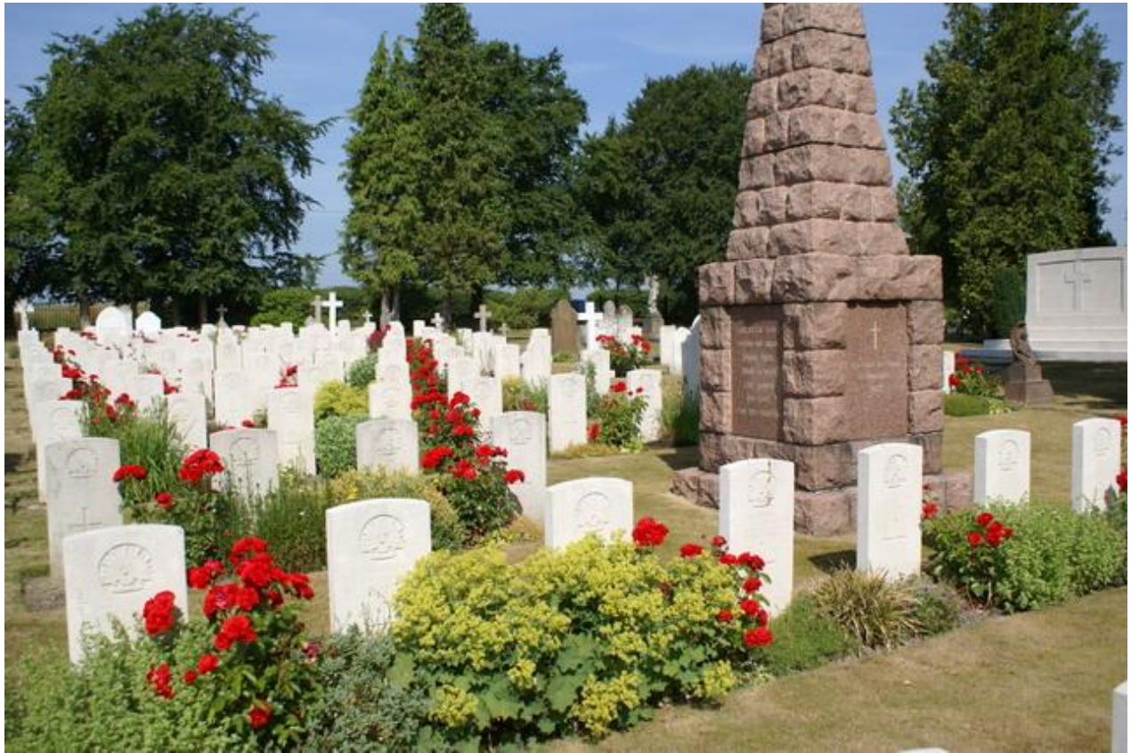
Durrington Cemetery, Wiltshire